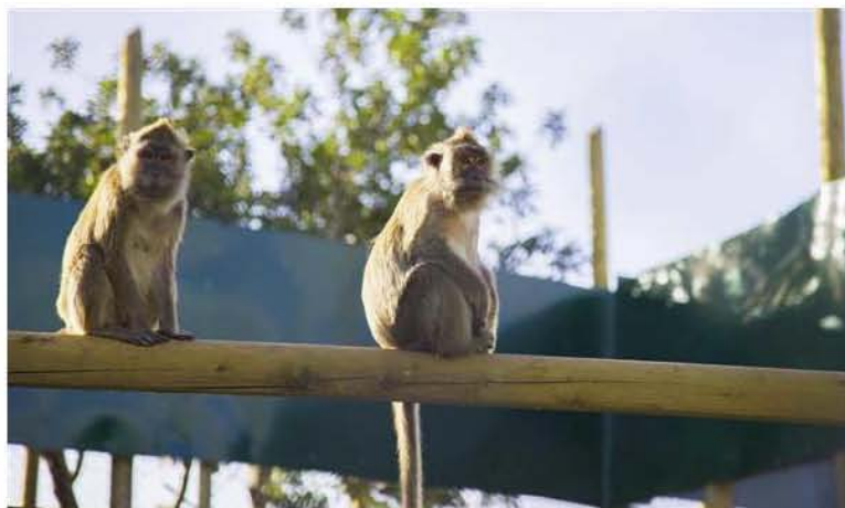
Two of more than 1,200 monkeys saved from of laboratory testing sit in an enclosure in Tel Aviv, Israel. Gil purchased the 1,250 long-tailed macaques from the secretive Mazor Farm, which had planned to shift its operation to Florida after Israel's laws governing wild animal exports changed in January.

The Israeli-born Gil said Mazor Farm, which is located near Ben Gurion airport, had shipped around 6,000 monkeys to laboratories worldwide at a price of $3,500 each since it began operating in the early 1990s.